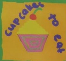
Cupcakes for all