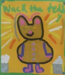
Wack the rabbit