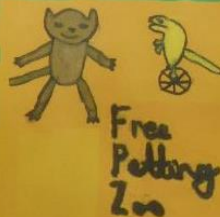
Free Petting Zoo