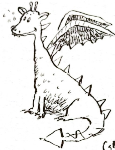
The Common or Garden Basic Brown

The Common or Garden and the Basic Brown are so similar that they can be dealt with together. These are the