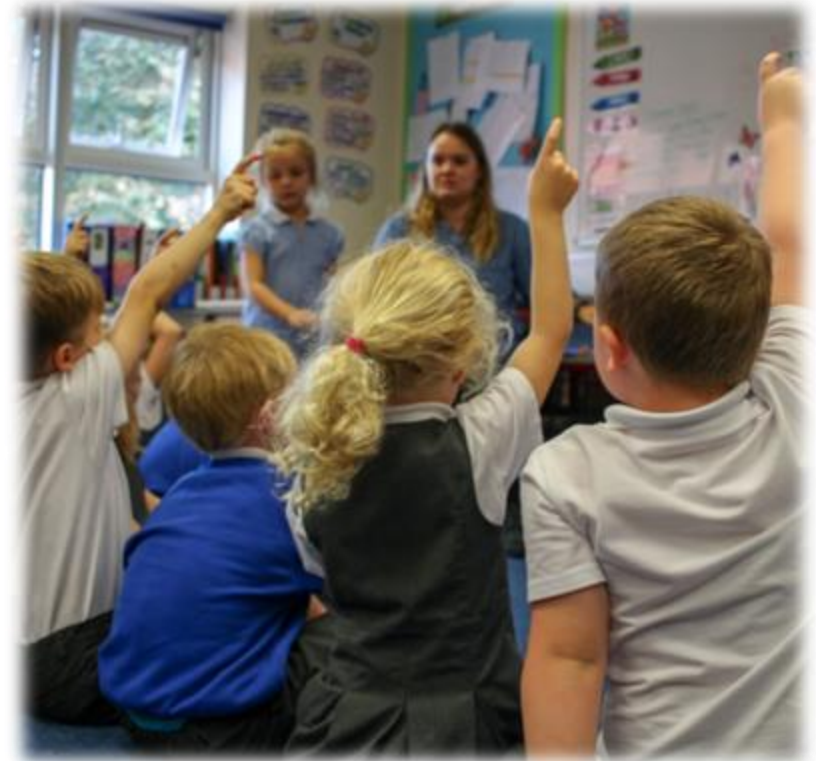
Table Top Learning